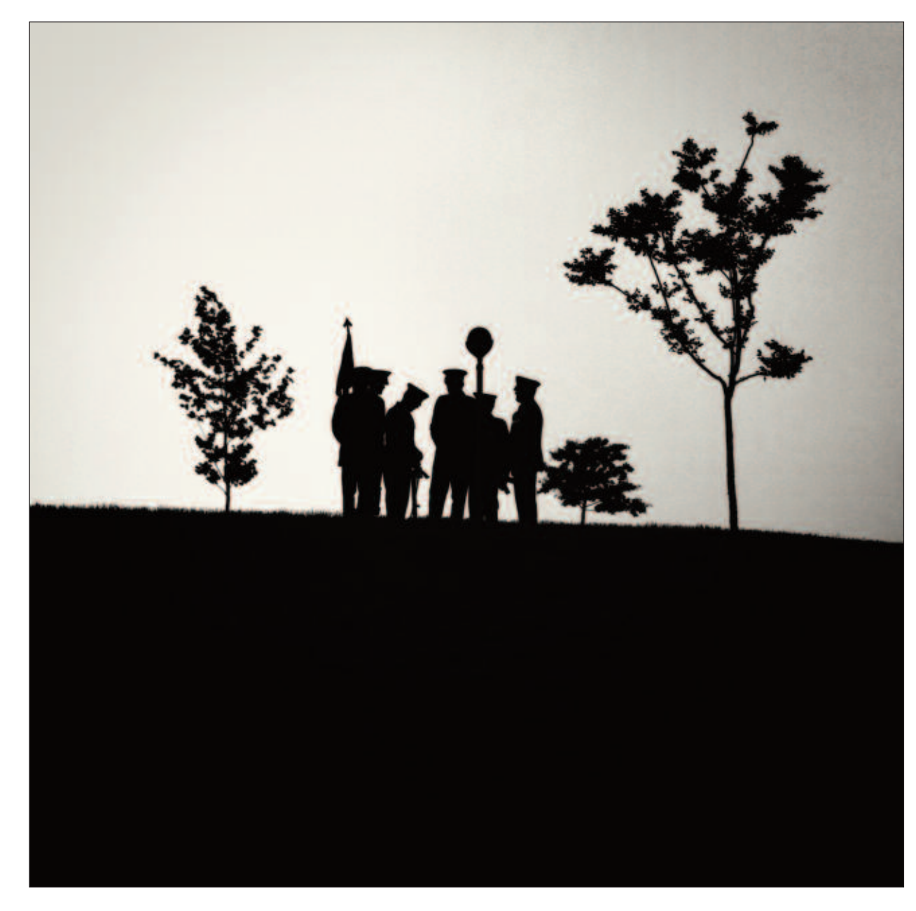
A Soldier's Funeral. Arlington National Cemetery, Virginia, USA. 2008